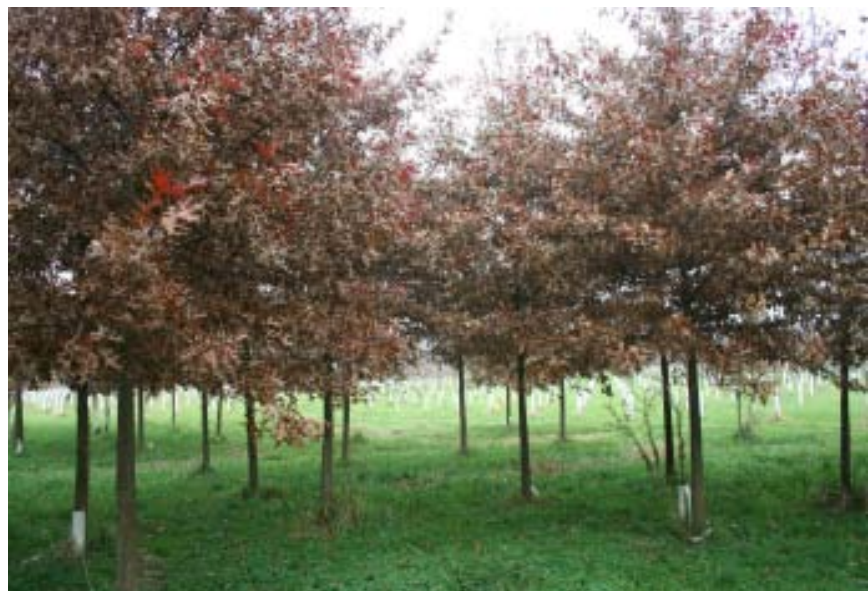
A field of Quercus palustris Pin Oak