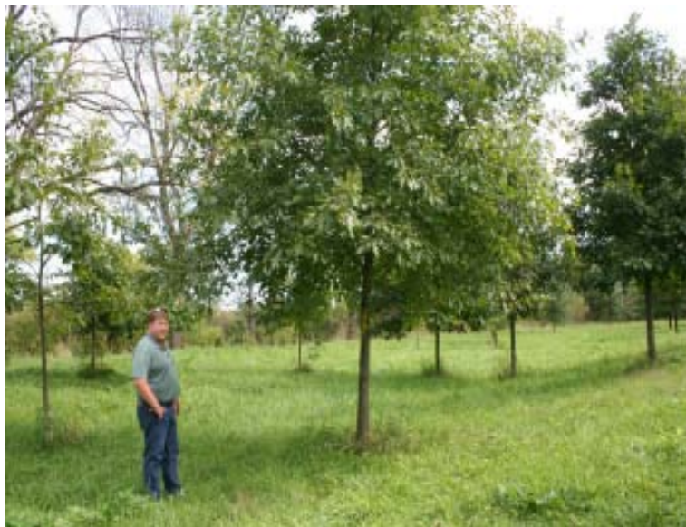
A field of Quercus rubra , Red Oak

Oaks are slow growing, but are well worth the wait! With proper water and fertility, I've seen them grow as much as 6' a year in my own yard! Ask us how we did this!