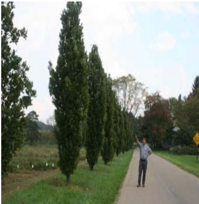
Brian Wade beside a planting of of Quercus robur 'Crimson Spire' Crimson Spire Pyramidal English Oak