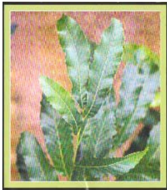
Quercus acutissima , SAWTOOTH OAK