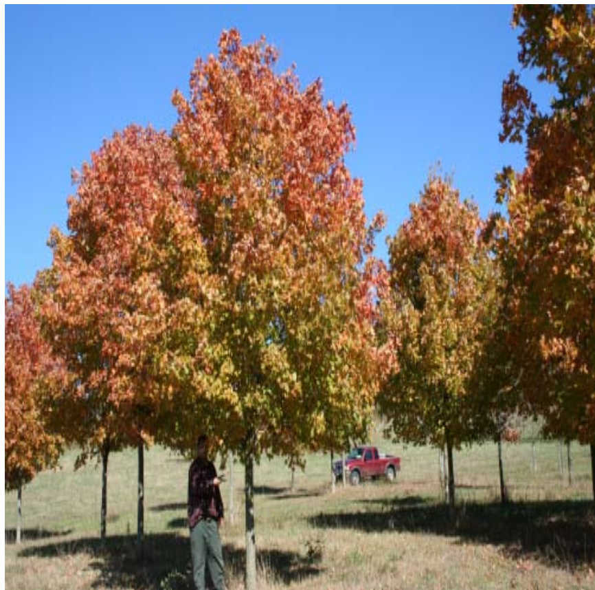
Brian Wade with a special group of Quercus rubra Red Oak