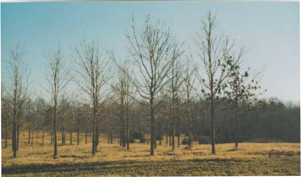
Large Quercus rubra , Red Oaks in our nursery fields.