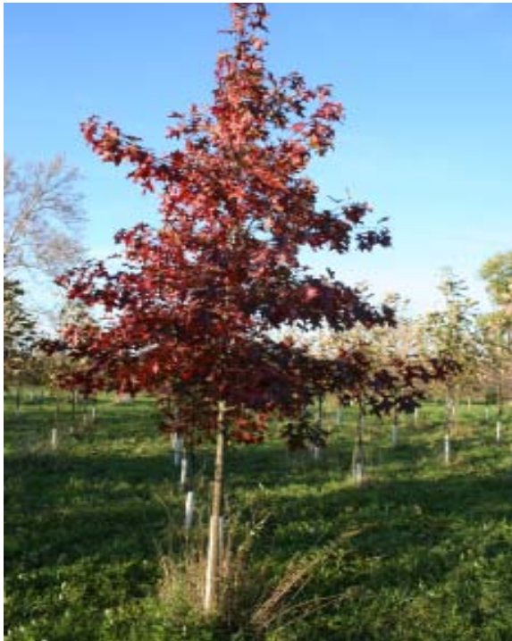
Quercus coccinea Scarlet Oak