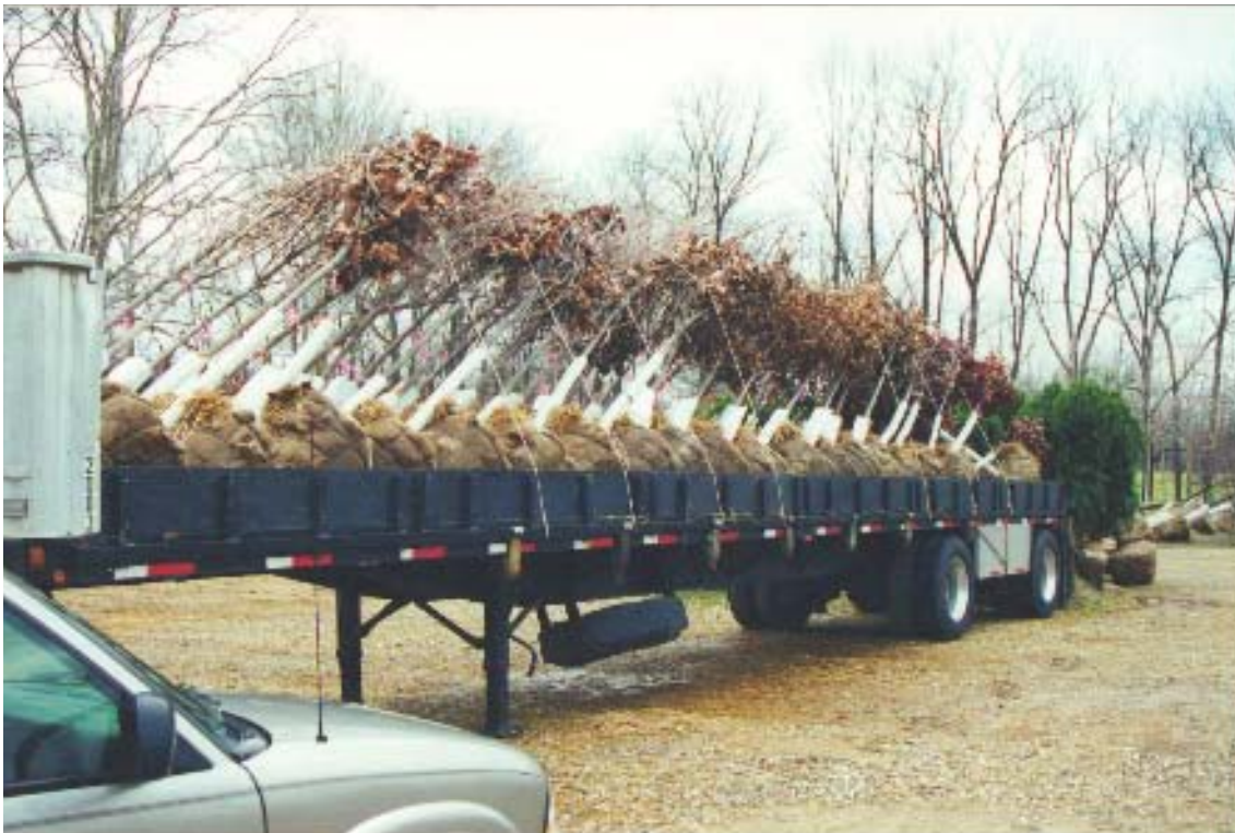
44' Semi Load of Quercus coccinea , Scarlet Oak ready to go!

All of our trees are twice transplanted and root pruned when planted. They have a good root system, and are far superior to only once transplanted trees.