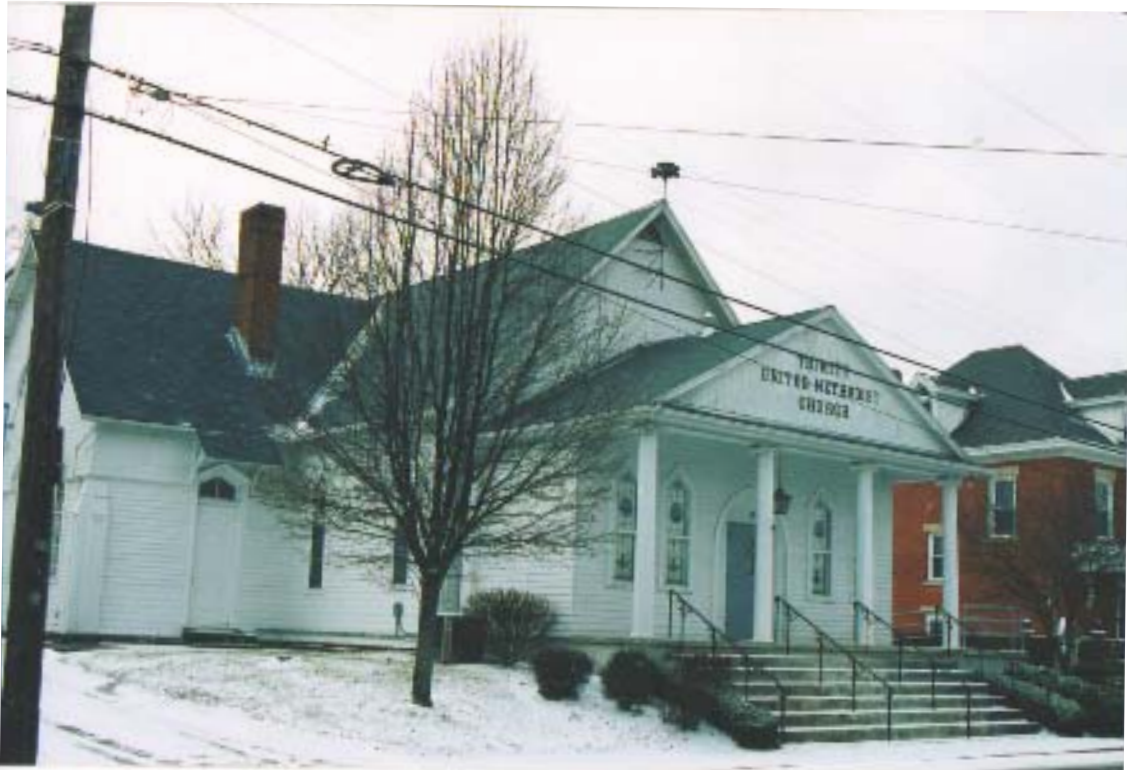
Above: A specimen Pyrus calleryana 'Cleveland Select', 10" plus caliper growing as a specimen at the entrance of the Trinity United Methodist Church in Butler, Ohio. The tree has now been removed for renovation of a new church.