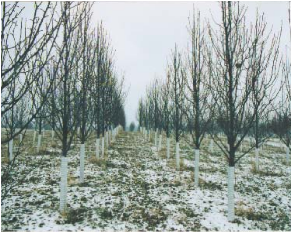
Pyrus calleryana 'Redspire', Redspire Callery Pear growing here on our Doups Valley View Farm. Notice the nice, well shaped tops. Exceptionally glossy green foliage from May thru October.