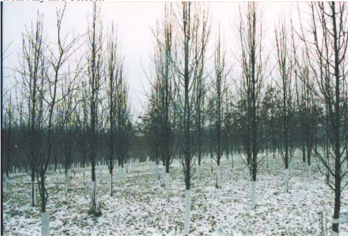
Pyrus calleryana 'Cleveland Select', Cleveland Select Callery Pear located on Goat Hill. Notice the white tree guards which protect the trees from the 30 plus white tailed deer located on the farm.