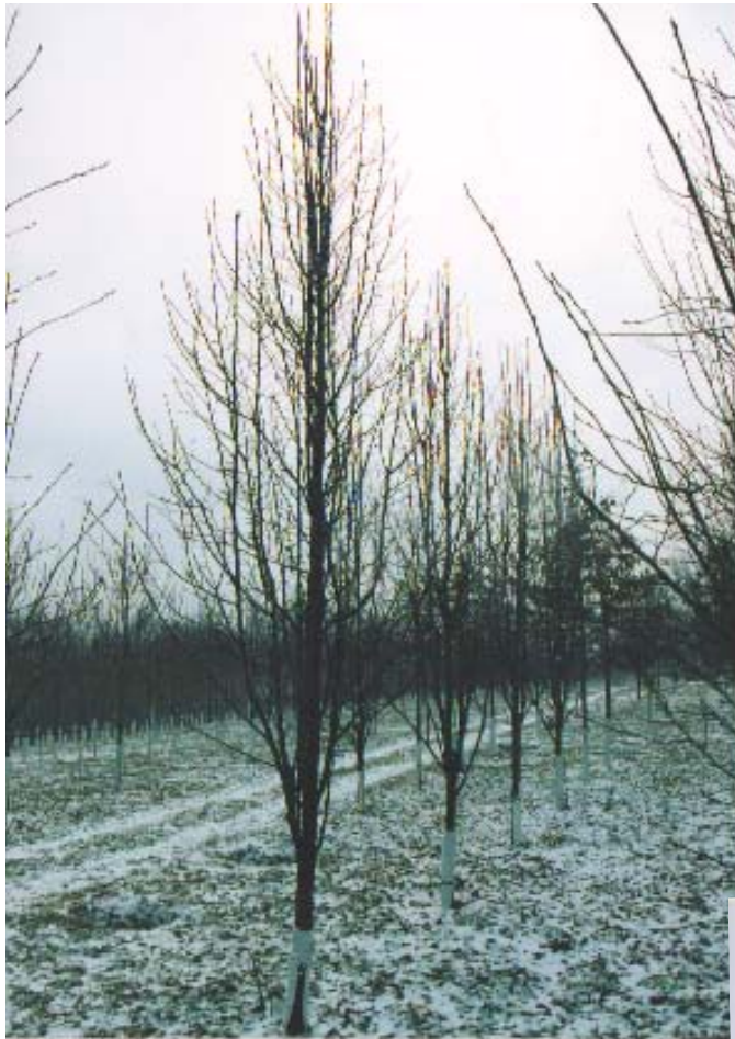
Pyrus calleryana 'Cleveland Select' CLEVELAND SELECT CALLERY PEAR Our most popular ornamental Pear! Has lovely pure white flowers borne in abundance in April. Exceptionally thick, leathery leaves from May thru October, then turns an attractive burgundy-red in November. Pictures is a 3.00-3.50" caliper, 11-12' tall tree. Photo taken in late Winter of 2005.