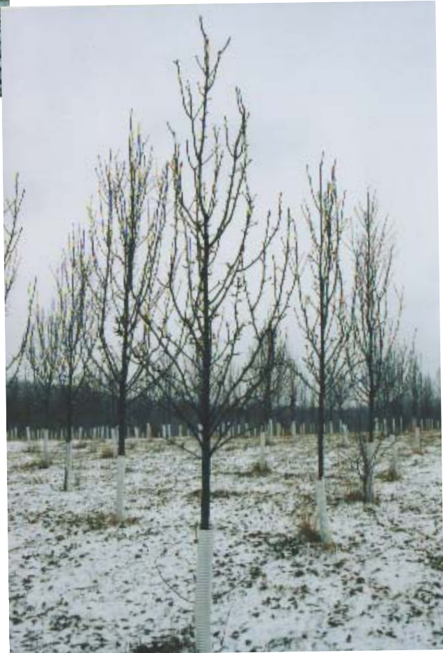
Pyrus calleryana 'Redspire' REDSPIRE CALLERY PEAR Growing on our Doups' Valley View Farm in southern Richland County.