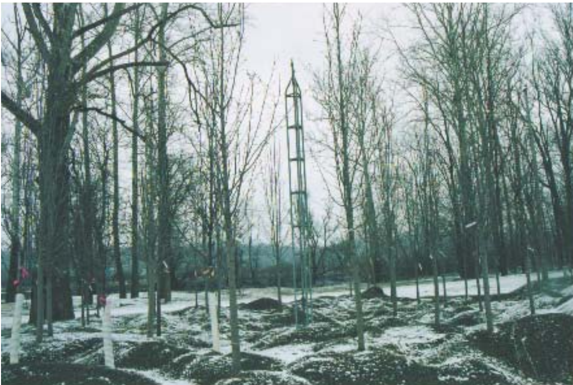
A view of Cleveland Select Pears heeled in here in washed pea granite gravel for summer sales. Trees are watered daily! They are available and ready to go anytime!