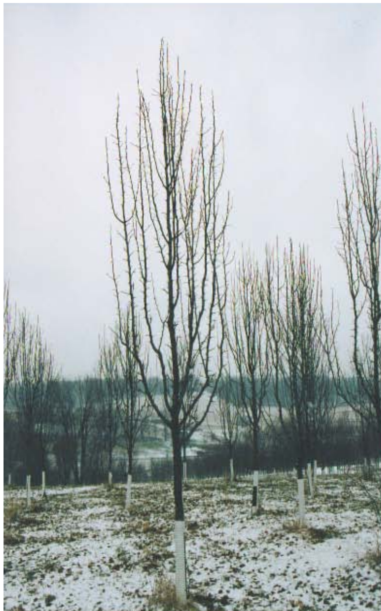
Pyrus calleryana ‘Capitol’, CAPITOL CALLERY PEAR

One of our newer Genera of ornamental trees that proves well worth watching. Demand for these hardy, glossy, deep green leaved, healthy looking ornamentals exceeds the supply in today’s markets. They not only make excellent street trees, but can be used to advantage in many residential, commercial, industrial, and municipal plantings.