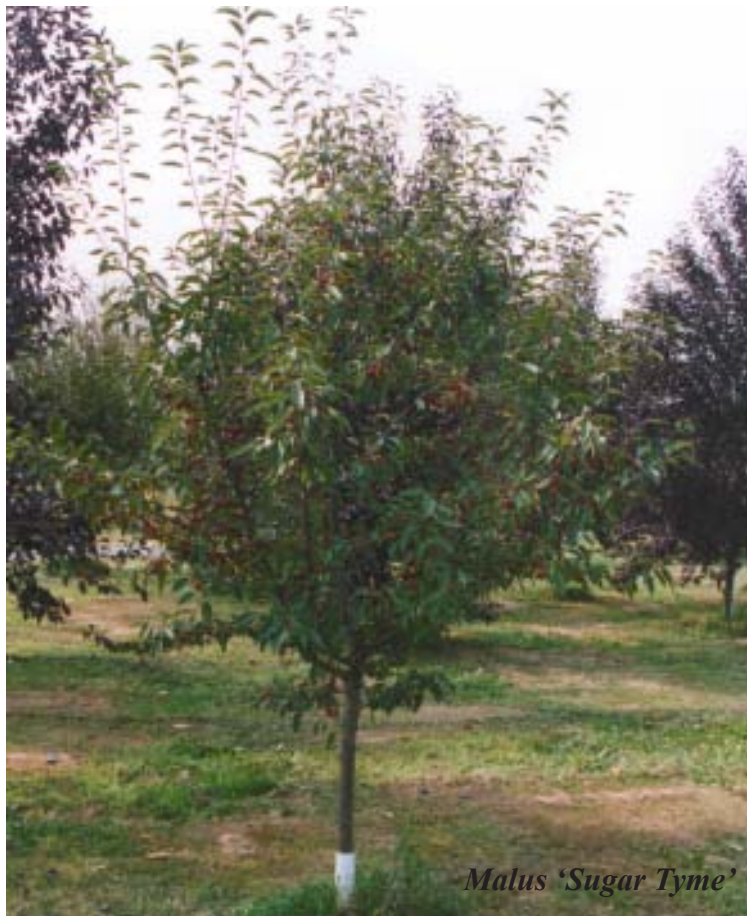
Malus 'Sugar Tyme'