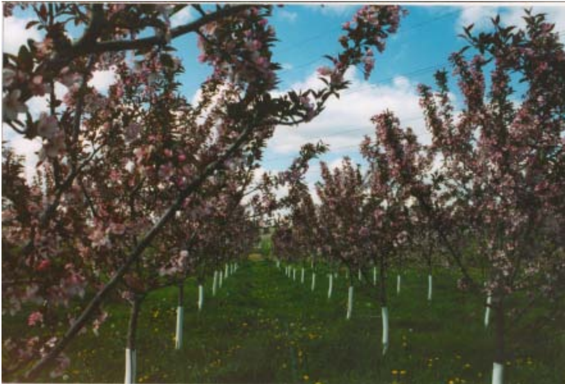
Malus 'Strawberry Parfait'