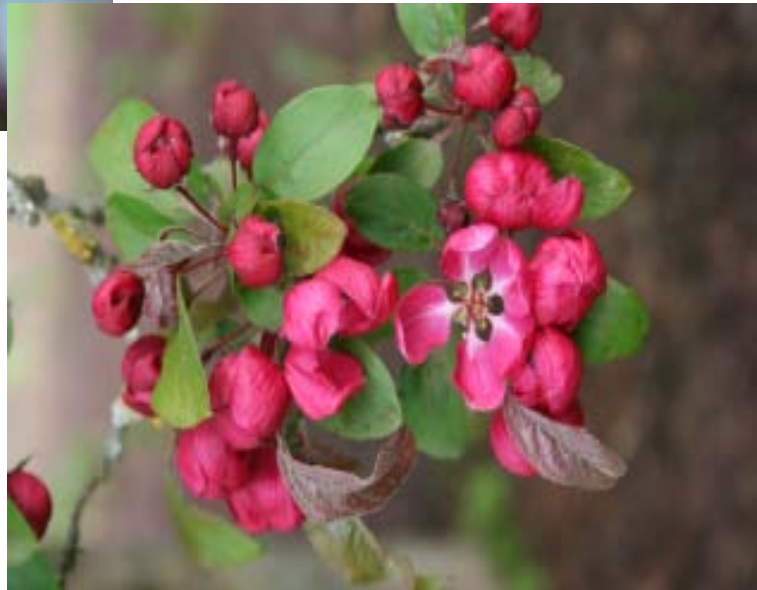
Beautiful pink flower buds and flowers on Malus 'Indian Magic'