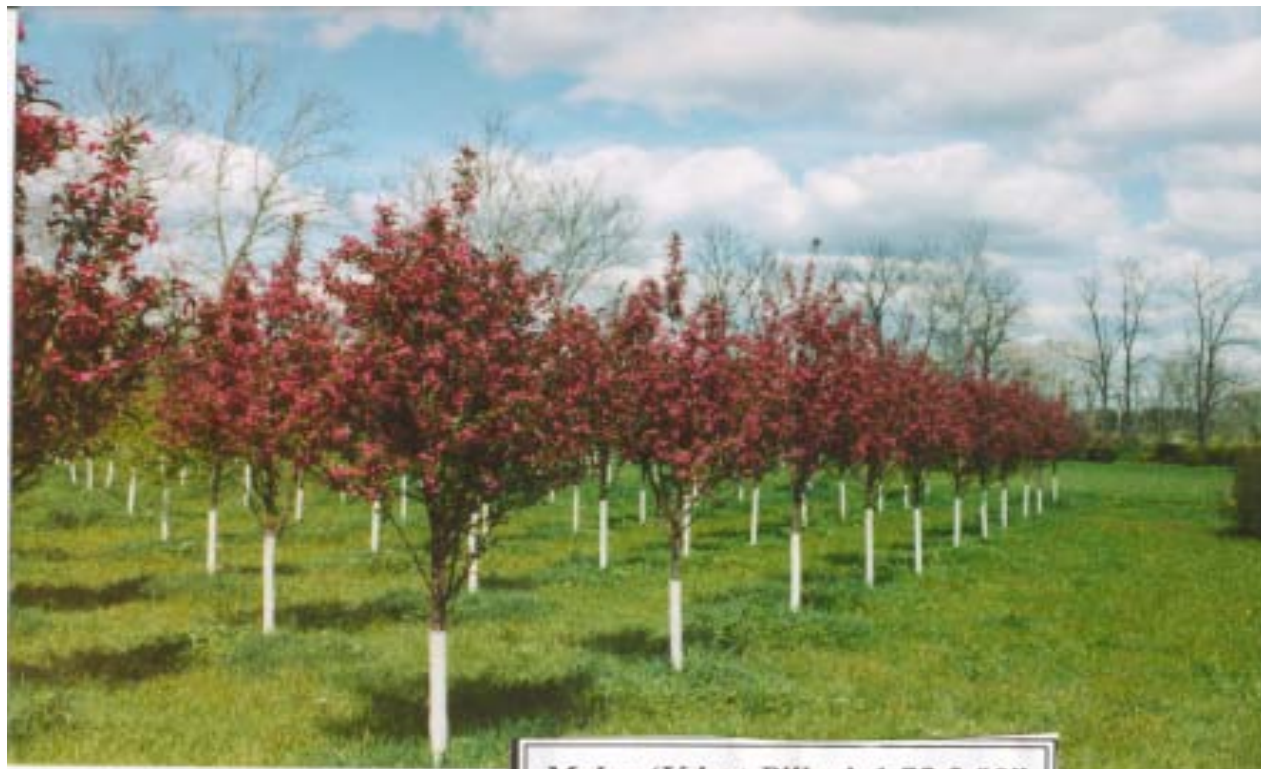
Malus 'Velvet Pillar', 1.75-2.00" caliper.