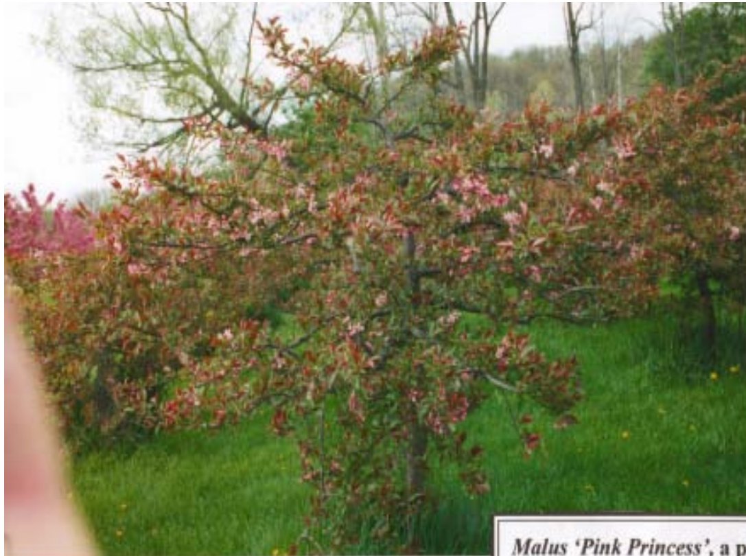
Malus 'Pink Princess', a pink flowering form of the dwarf, Sargent Flowering Crabapple.