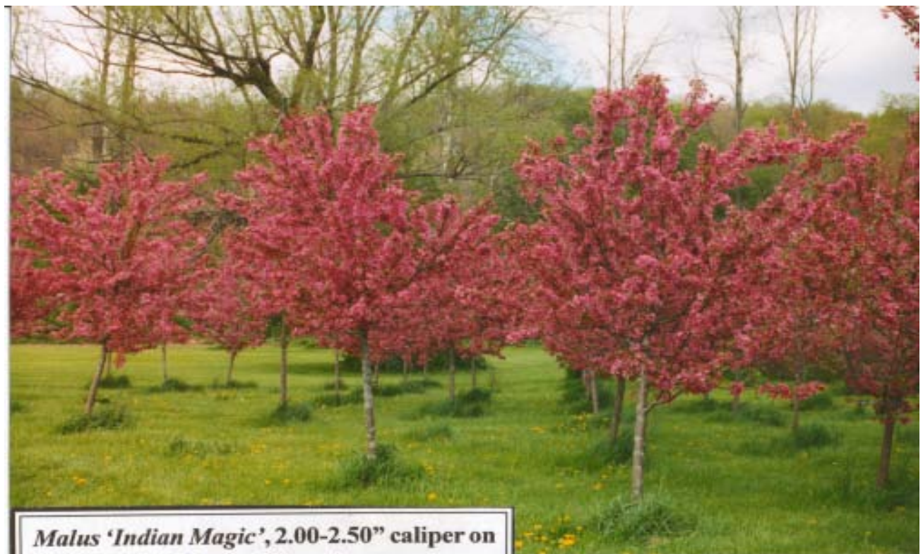
Malus 'Indian Magic' , 2.00-2.50" caliper on our Bellville Plot on Hines Avenue.