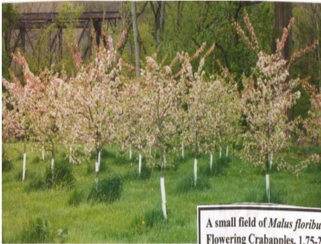
A small field of Malus floribunda , Japanese Flowering Crabapples, 1.75-2.00" caliper.