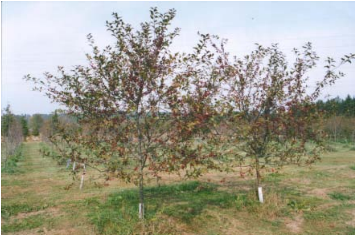
Malus 'Prairie Fire' in mid-October. Trees are 2.00" caliper.