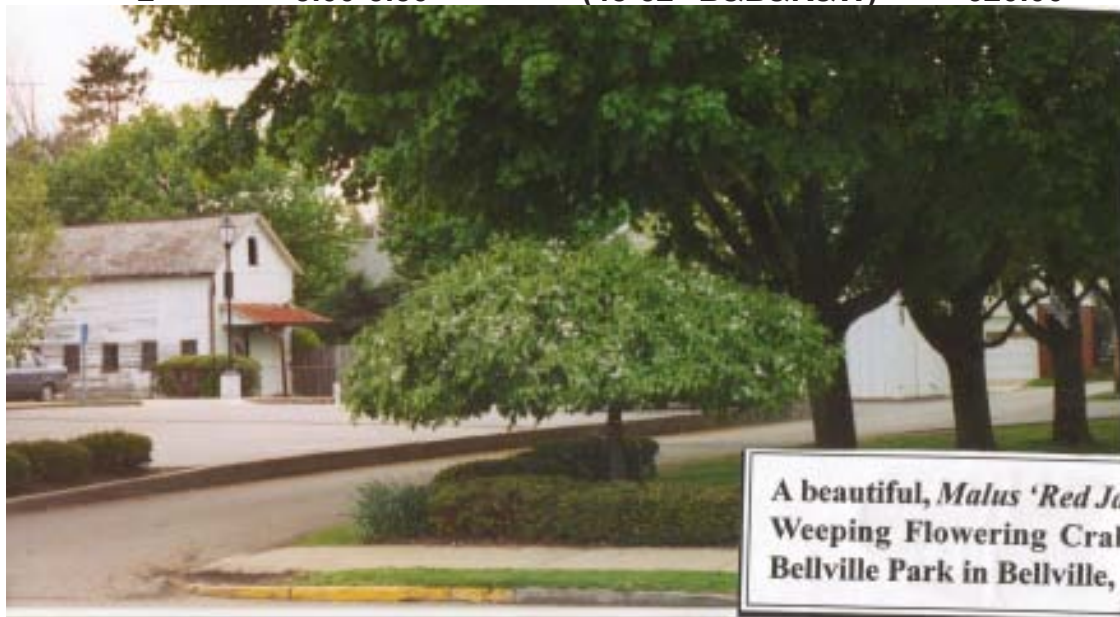
A beautiful, Malus 'Red Jade', Red Jade Weeping Flowering Crabapple in the Bellville Park in Bellville, Ohio.