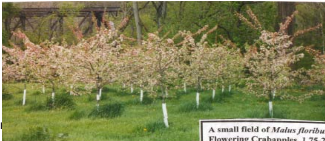
A small field of Malus floribunda , Japanese Flowering Crabapples, 1.75-2.00" caliper.