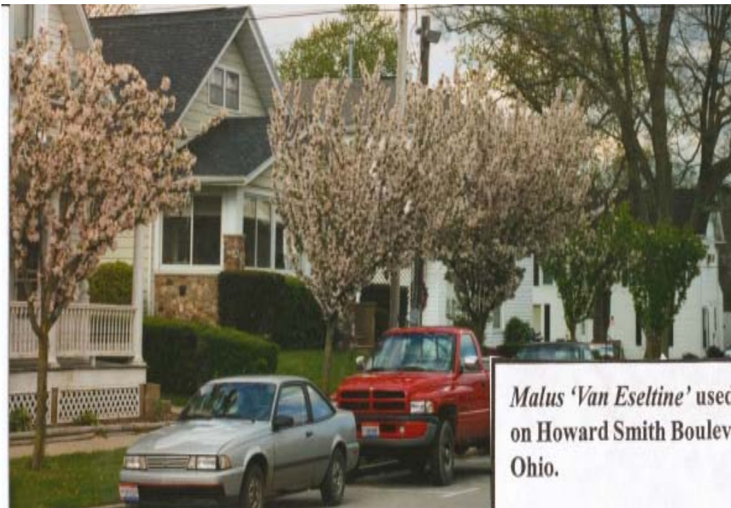
Malus 'Van Eseltine' used as a street tree on Howard Smith Boulevard in Bellville, Ohio.