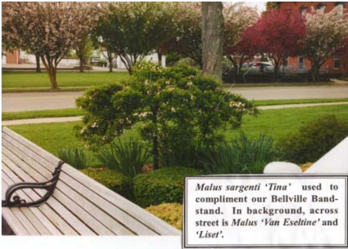
Malus sargentii 'Tina' used to compliment our Bellville Bandstand. In background, across street is Malus 'Van Eseltine' and 'Liset'.

Note: Caliper and top size is approximately, as each tree differs somewhat. But above guidelines are very close. We have been growing 'Sargent Tina' since 1987, and it is one of our better selling very dwarf Flowering Crabapples.