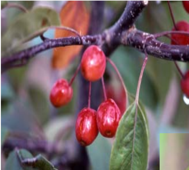
Beautiful small red fruit on Malus 'Indian Magic'