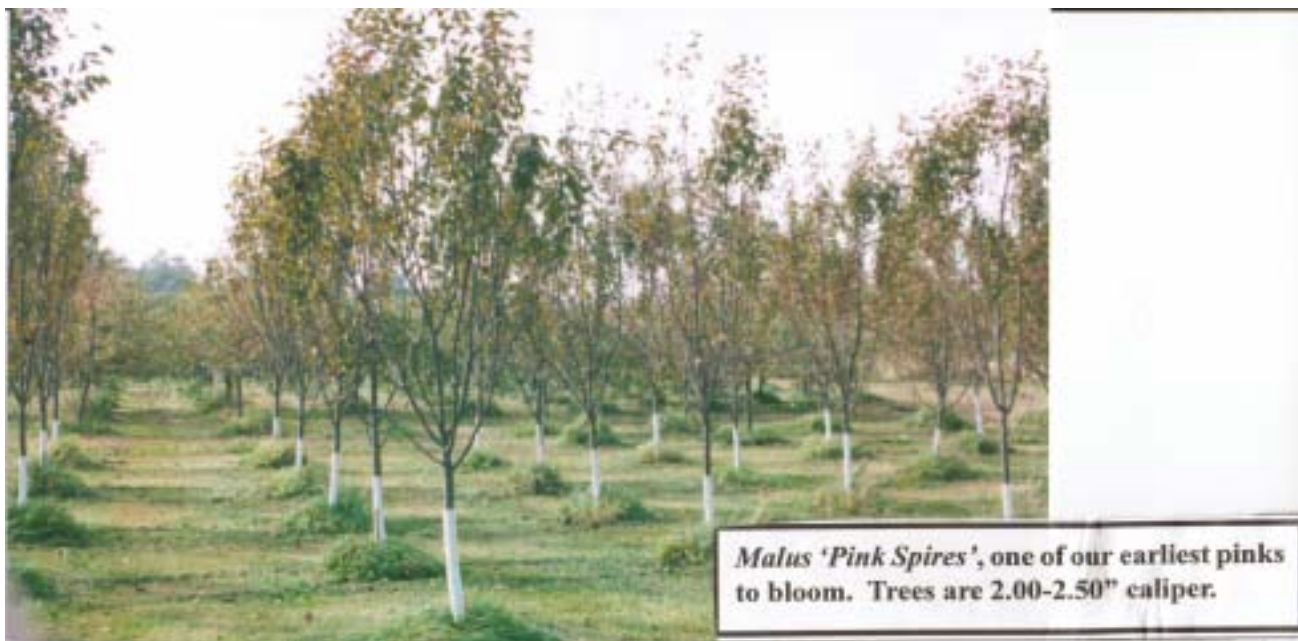
Malus 'Pink Spires', one of our earliest pinks to bloom. Trees are 2.00-2.50" caliper.