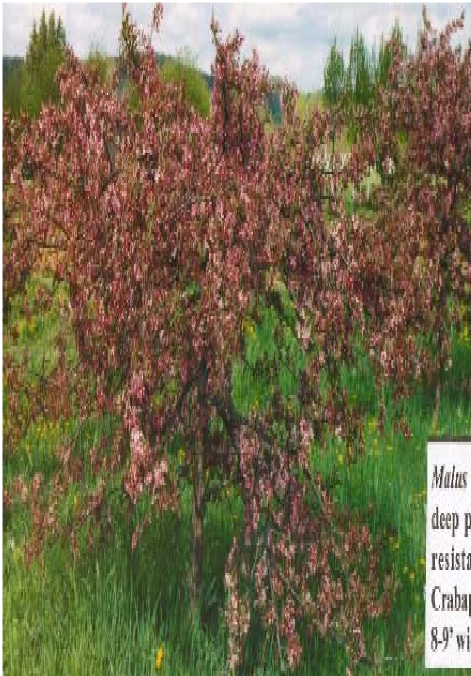
Malus 'Candy mint', a low growing, deep pink, wide spreading, disease resistant, ornamental Flowering Crabapple. This is a 3" caliper tree, 8-9' wide and 6' tall.