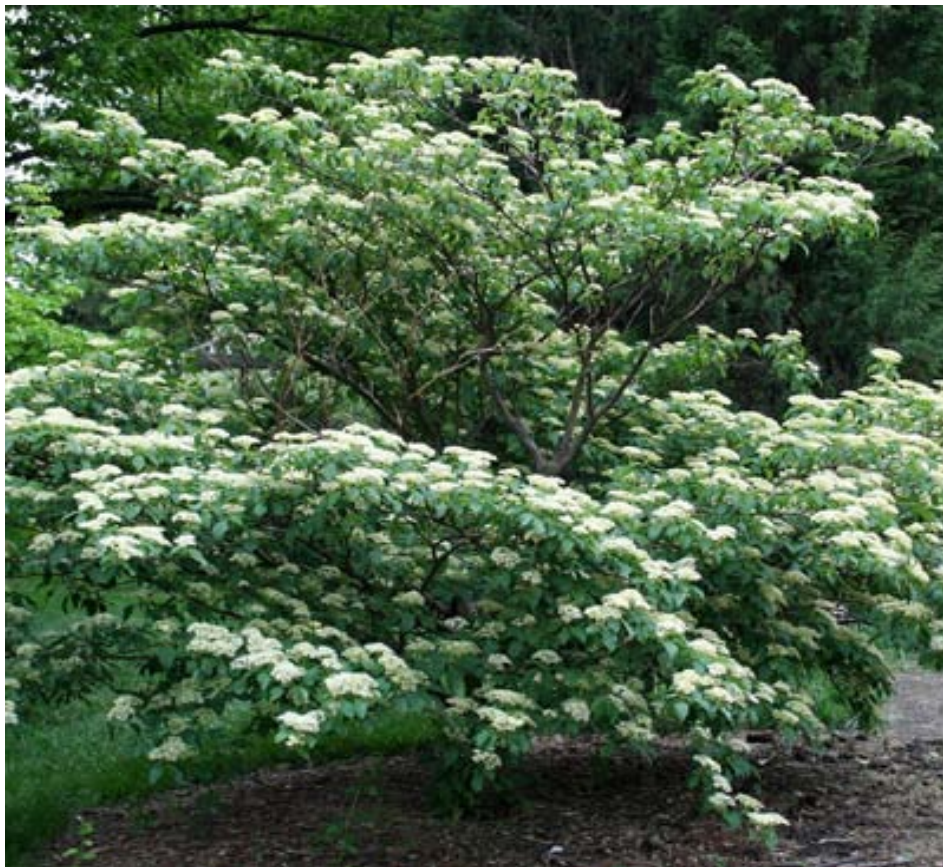
Cornus alternifolia, PAGODA DOGWOOD