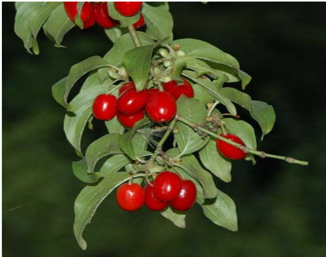
Fruit on Cornus mas CORNELIAN CHERRY DOGWOOD