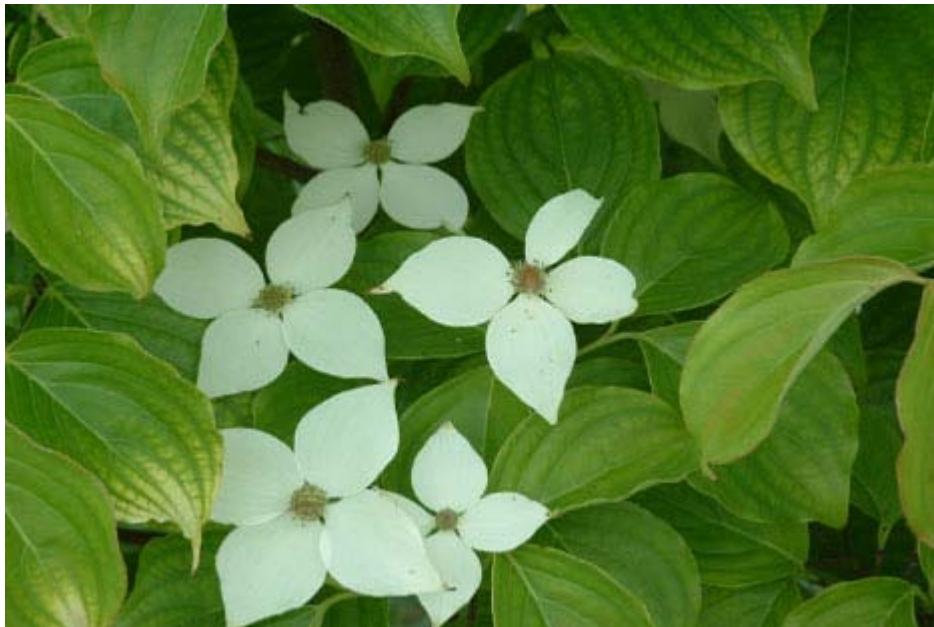
Leaf and flower of the Cornus kousa , Chinese Flowering Dogwood