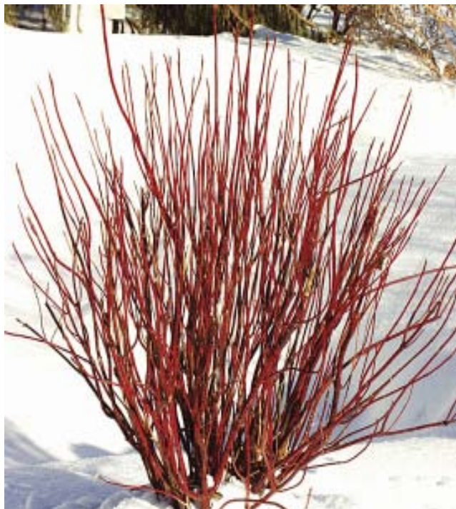
Winter branches of the Cornus stolonifera, RED OSIER DOGWOOD