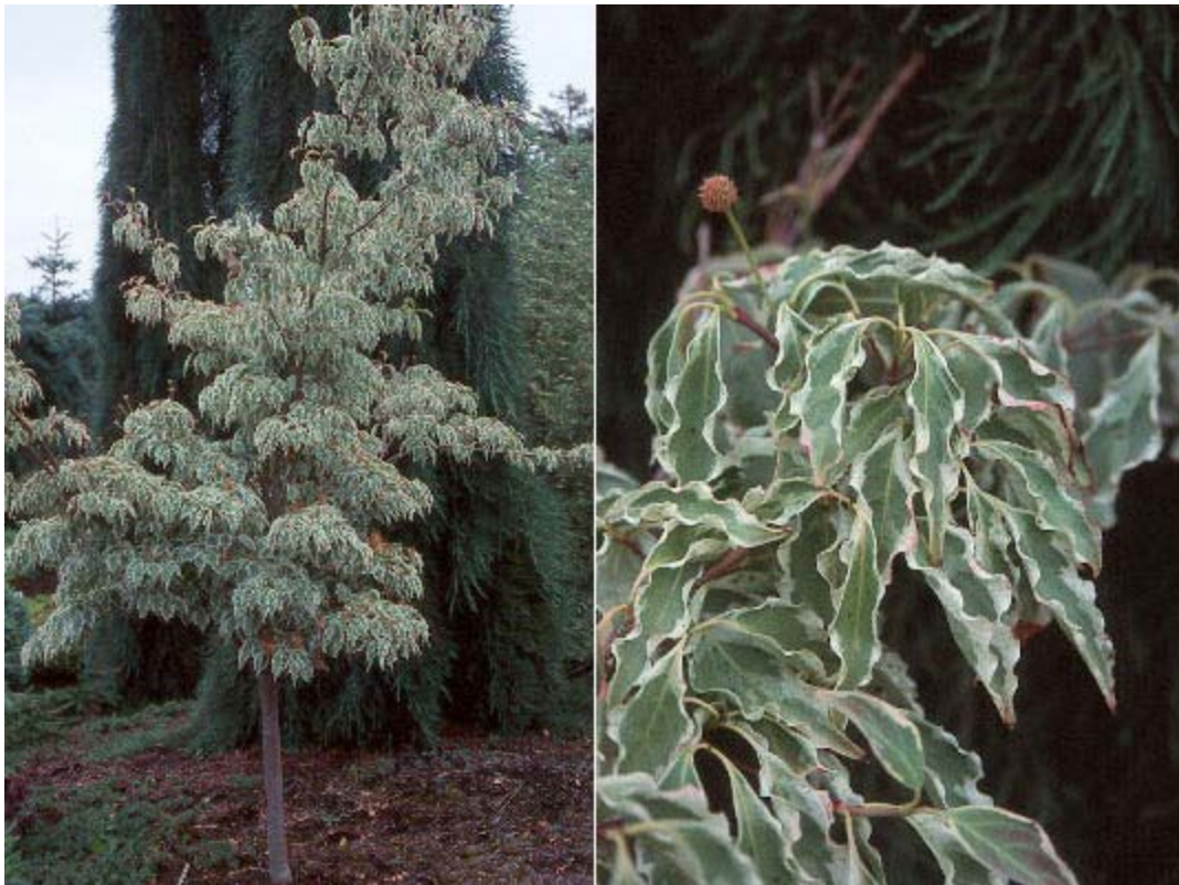
Cornus kousa 'Wolf Eyes' WOLF EYES CHINESE FLOWERING DOGWOOD