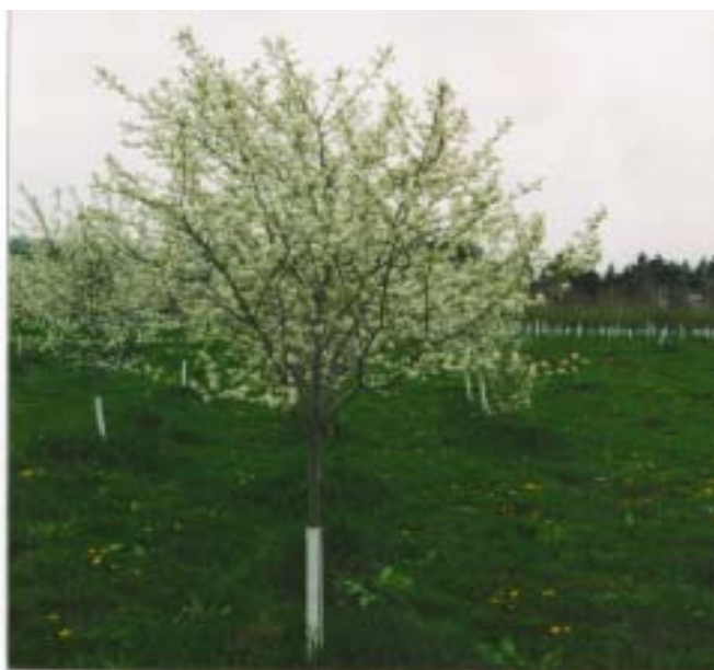
A nice 'Tree Form', Amelanchier grandiflora 'Princess Diana' in full bloom in the Spring.