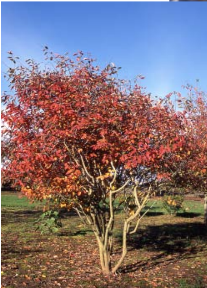
Amelanchier grandiflora 'Autumn Brilliance' (Clump Form) with its beautiful fall color!