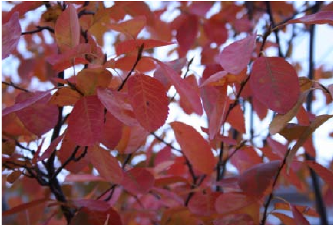
Amelanchier grandiflora 'Autumn Brilliance' - fall leaf color