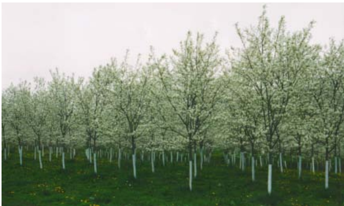
A nice field of Amelanchier grandiflora 'Autumn Brilliance' in full bloom in Spring!