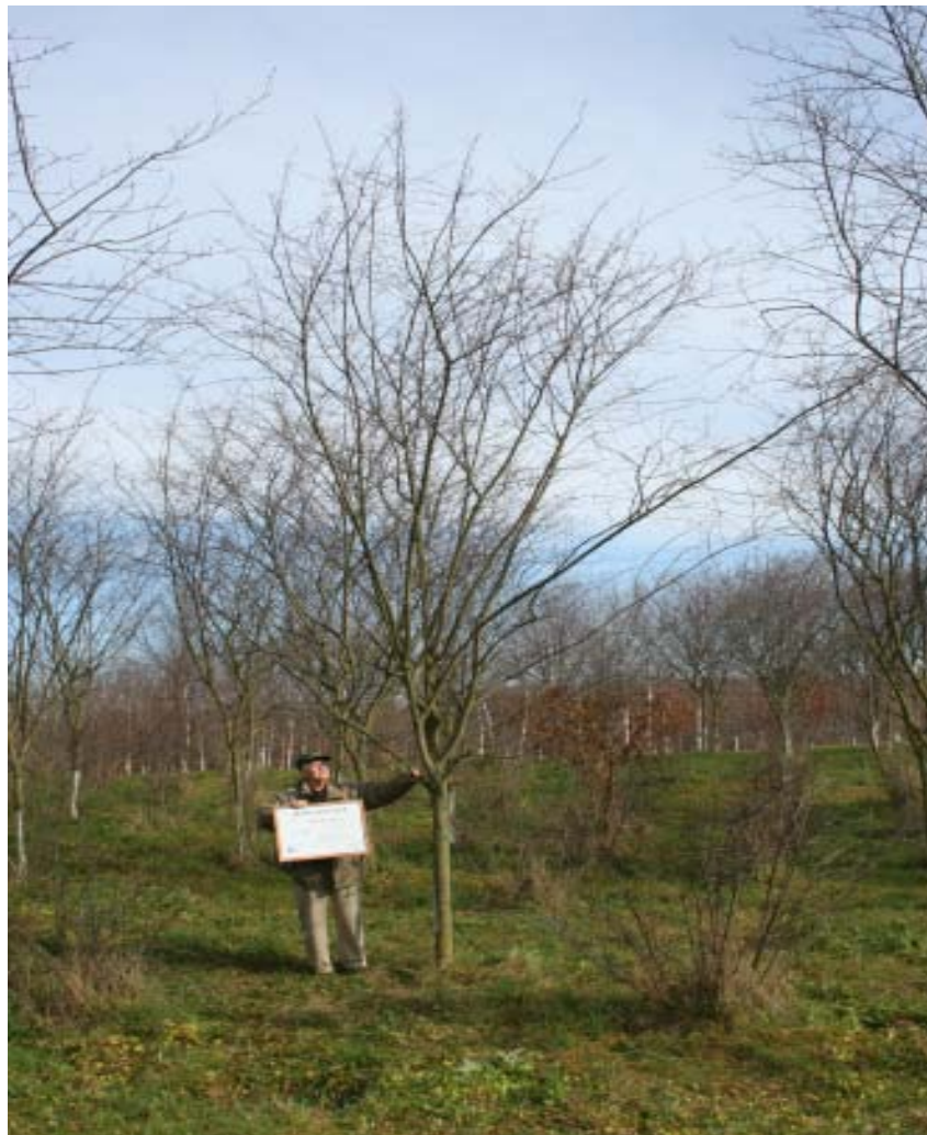
Van Wade shown here with a 'Tree Form' Amelanchier arborea , Downy Serviceberry in late fall.

(Trees are available as single, or as two stemmed trees, please specify if you wish two stemmed trees)