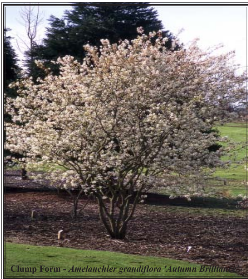
Clump Form - Amelanchier grandiflora 'Autumn Brilliance'

Wade & Gatton Nurseries 1288 Gatton Rocks Road Bellville, Ohio 44813