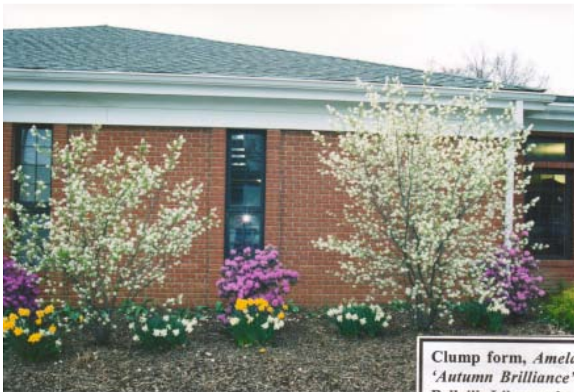
Clump form, Amelanchier grandiflora 'Autumn Brilliance' shown beside our Bellville Library showing blooming with daffodils and P.J.M. Rhododendrons in early April of 2004.