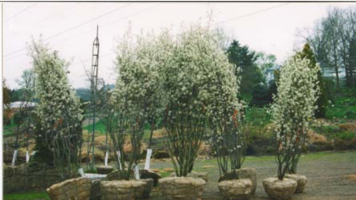
Amelanchier grandiflora 'Autumn Brilliance', 8-10' clumps dug for an order. Notice the pure white flowers come out just before the leaves sprout out.