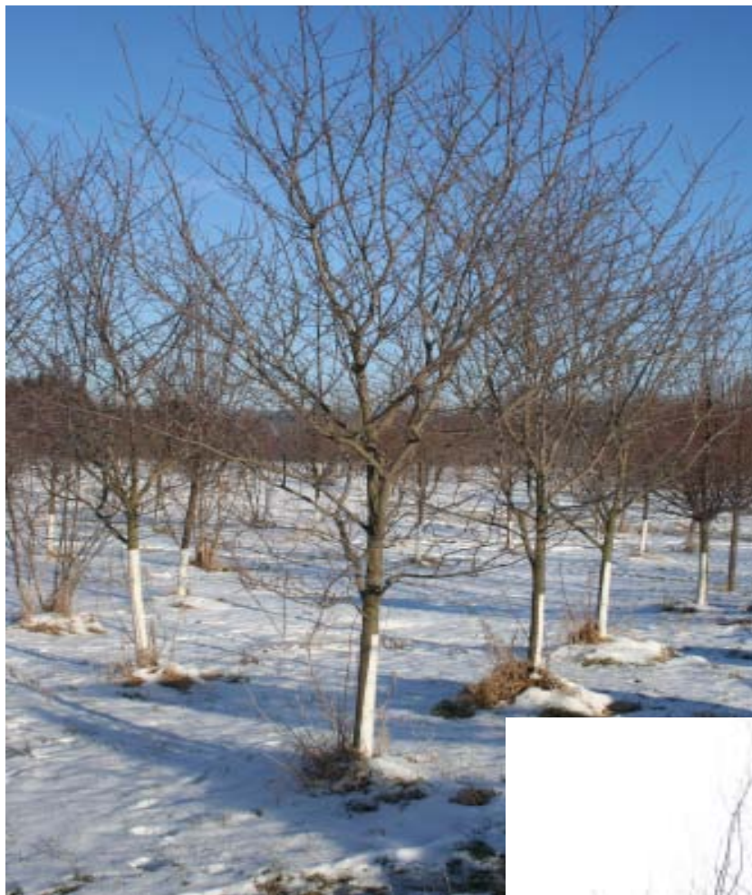
Amelanchier canadensis Shadblow Serviceberry (Tree Form) in the winter snow.