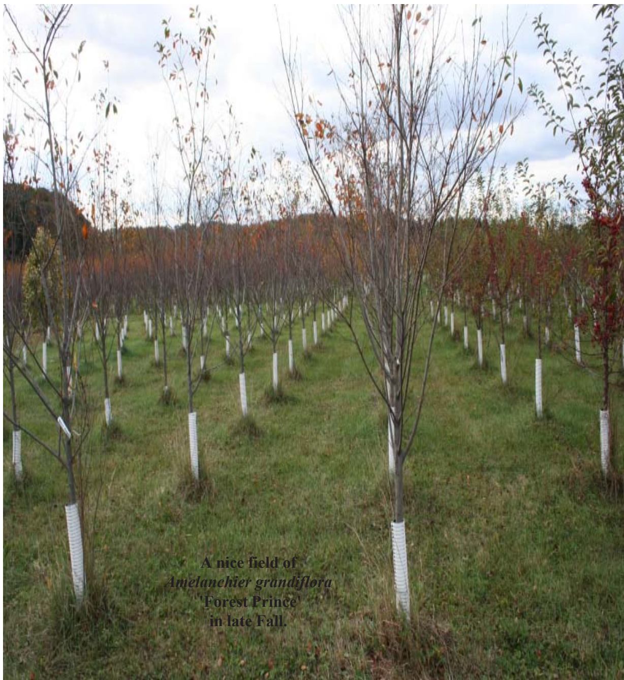
A nice field of Amelanchier grandiflora 'Forest Prince' in late Fall.