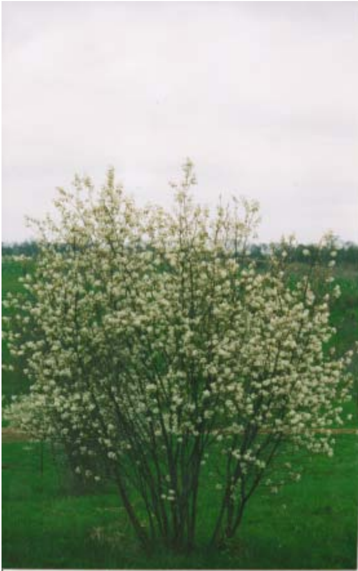
Amelanchier grandiflora 'Autumn Brilliance' growing in our nursery field in full bloom!