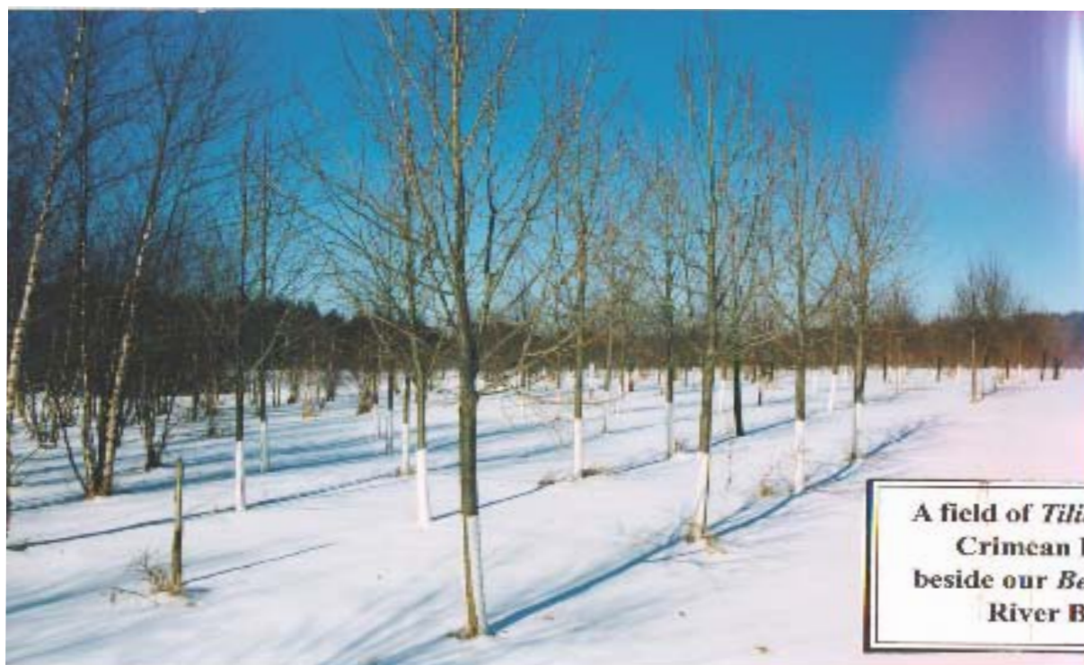
A field of Tilia euchlora , Crimean Linden, beside our Betula nigra , River Birch.

The Lindens are excellent shade trees for the homeowner, for street trees, parks, schools, playgrounds, malls, or in large planter boxes, nursing homes, hospitals, apartment or condominium complexes. Lindens can be planted for hedge row effects, and trimmed into hedges for windbreaks, shelterbelts, and hedging. They are very effective when trimmed into a large hedge.