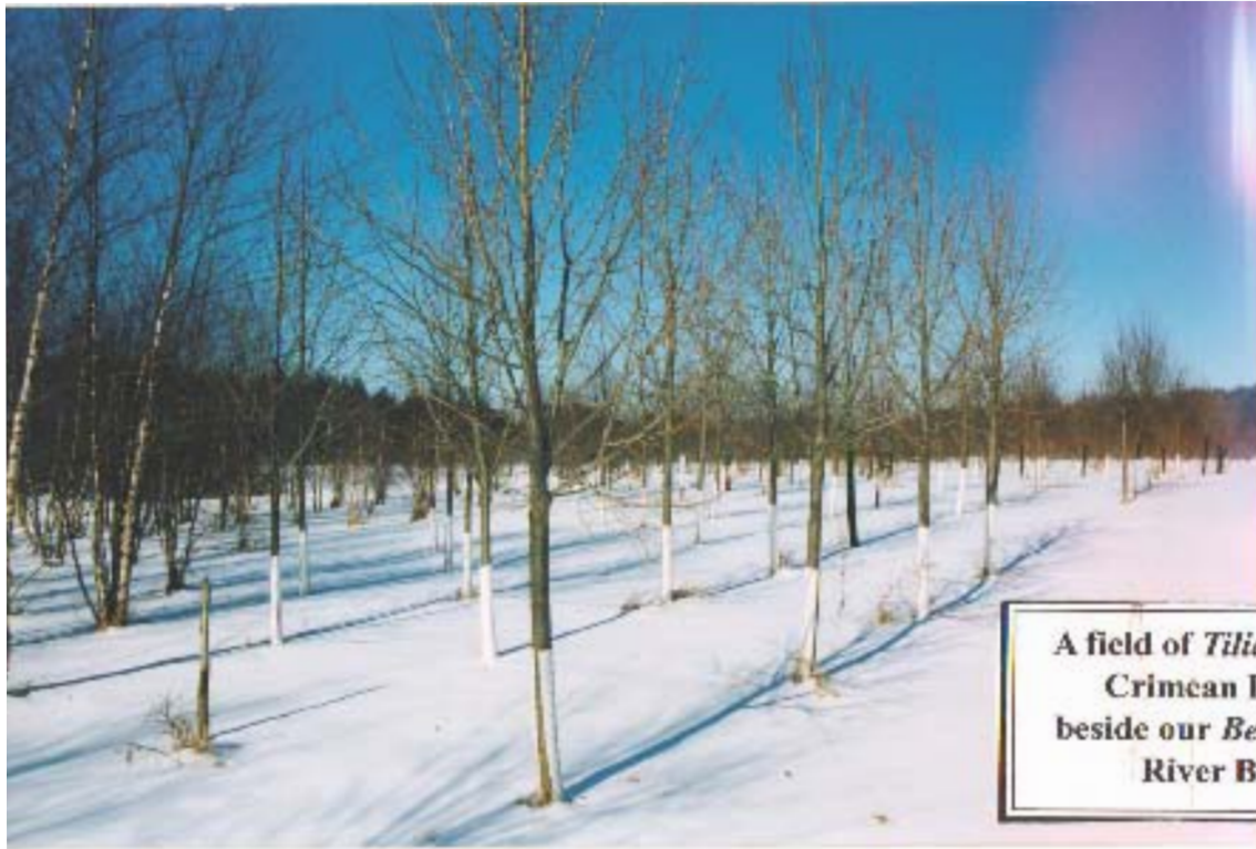
A field of Tilia euchlora , Crimean Linden, beside our Betula nigra , River Birch.

Wade & Gatton Nurseries 1288 Gatton Rocks Road Bellville, Ohio 44813 (1928 - 2011) Our 83rd Year Telephone: 419-883-3191 Fax: 419-883-3677 (24 Hour) Email: wadeandgatton@yahoo.com Website: wadeandgattonnurseries.com Hours: 8:00 a.m. - 5:00 p.m. Monday thru Saturday (Closed Sundays & Holidays)