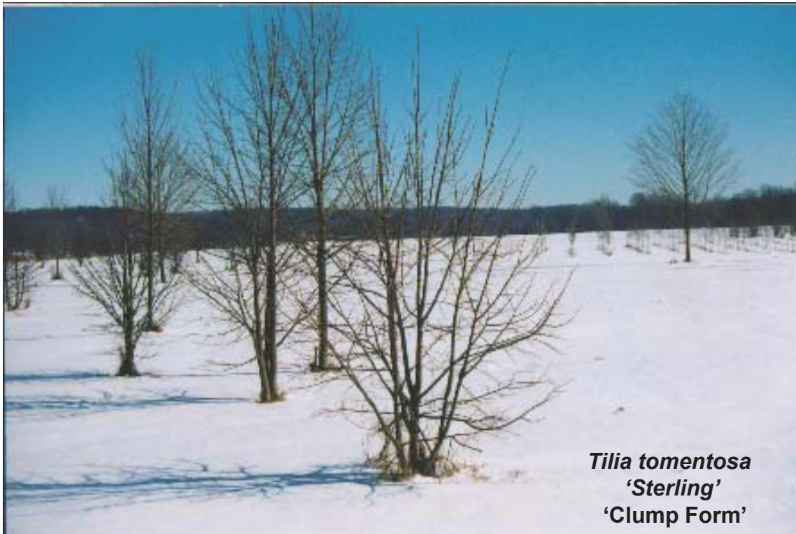
Tilia tomentosa 'Sterling' 'Clump Form'