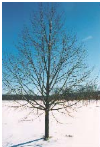
A 4 inch caliper Tilia tomentosa ‘Sterling’ in one of our

(ALSO AVAILABLE IN CLUMP FORM - SEE LAST PAGE OF PRICE LIST)